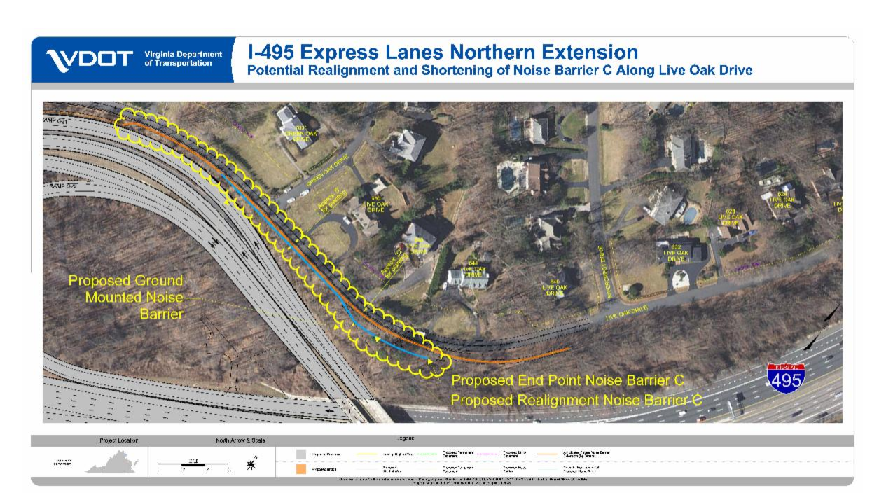
Click Here for a Closer View of This Graphic